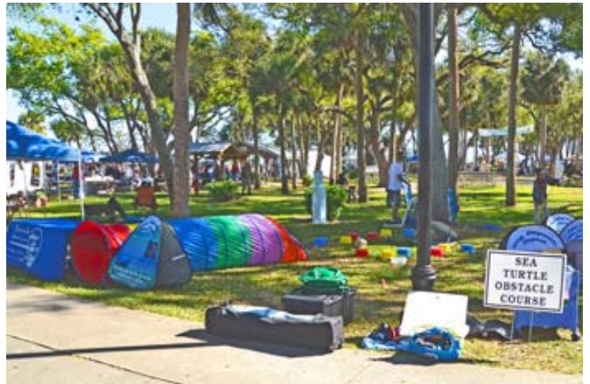
Sea Turtle Obstacle Course

Even though this was our 26 th year hosting the Pelican Island Wildlife Festival, not much about it was "routine" and its success was due to all the efforts of the many volunteers who work throughout the year organizing, and the many more who help out the day of the event! And, of course, it wouldn't be a success without our generous sponsors,