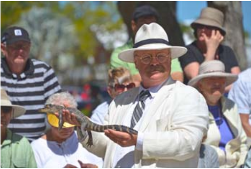
Teddy Roosevelt shows off baby alligator

PIPS celebrated the 115 th birthday of the Pelican Island National Wildlife Refuge with our 26 th annual Pelican Island Wildlife Festival in March. We hope you were able to join us for this fun and fabulous event once again! It was a gorgeous day but a bit on the windy side which, unfortunately, resulted in the cancellation of most of the boat tours to Pelican Island.